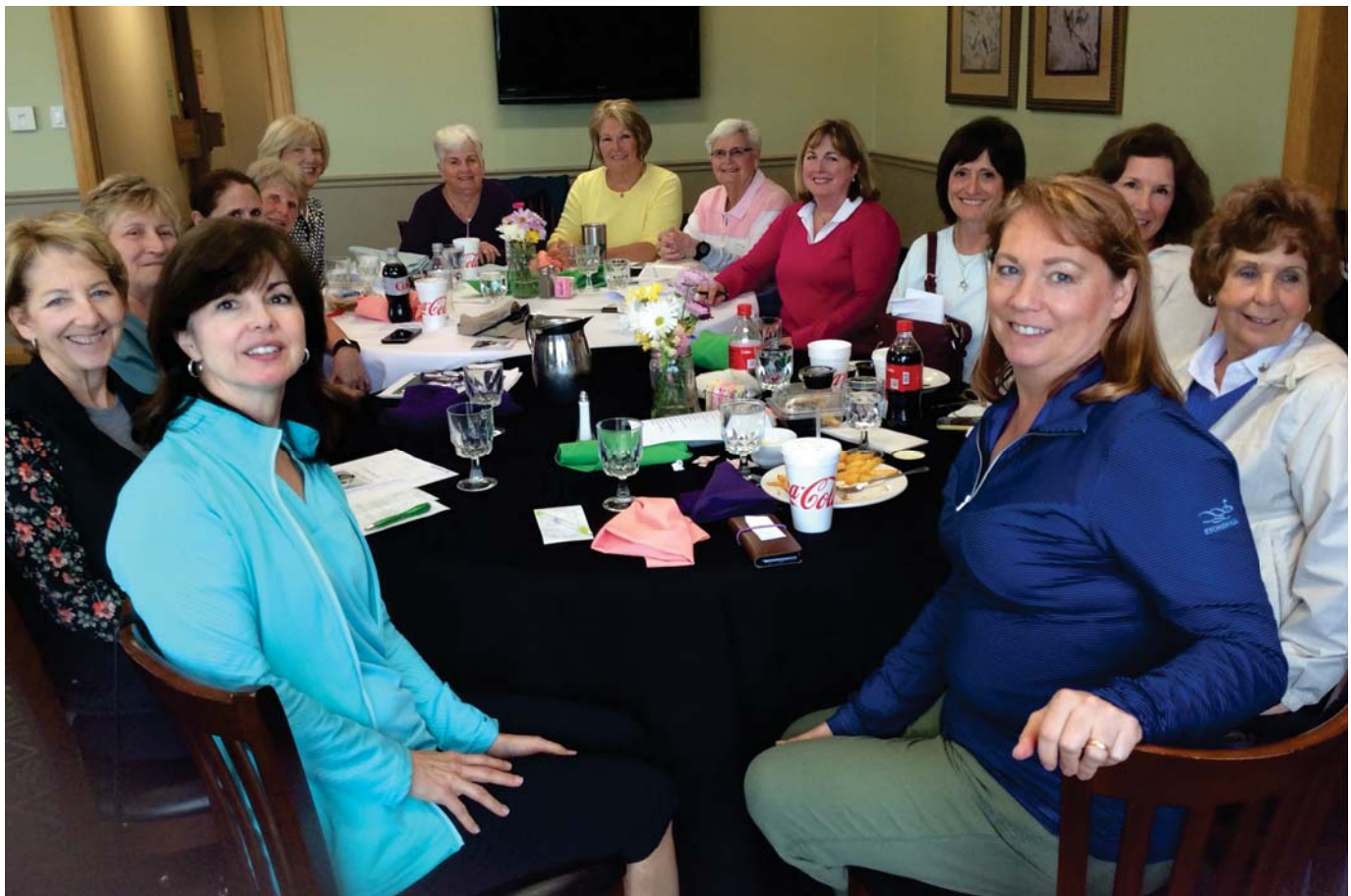
Photo from the recent Ladies Golf Luncheon